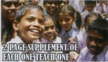
2 PAGE SUPPLEMENT OF EACH ONE TEACH ONE