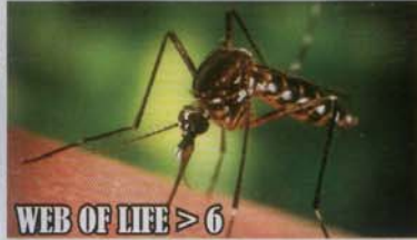
WEB OF LIFE > 6