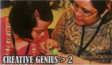
CREATIVE GENIUS > 2